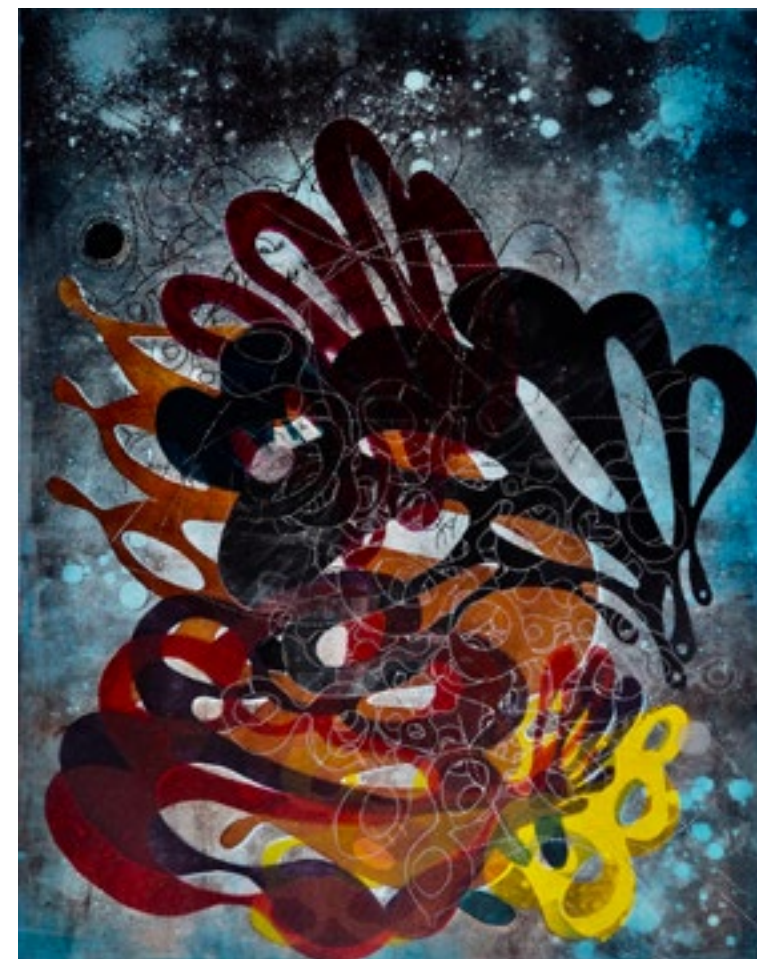
Taiko Chandler, Nightfall #5 , monoprint with stencils, 2019.

The exhibition is organized by the Jerusalem Botanical Gardens and Outset Contemporary Art Fund and opens simultaneously at 12 botanical gardens across six countries. The project has been made possible in partnership with The Jerusalem Foundation.