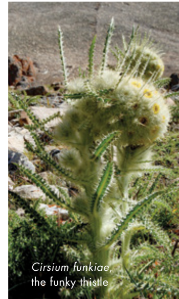
Cirsium funkiae , the funky thistle

Sometimes, new plant species are hiding right in plain sight. This scientific publication by Jennifer Ackerfield describes two new species that were doing just that – Cirsium funkiae (funky thistle) and Cirsium culebraense (Culebra Range thistle). These findings were the result of in-depth morphological and phylogenetic studies that determined these to be distinct entities from Cirsium scopulorum (mountain thistle).