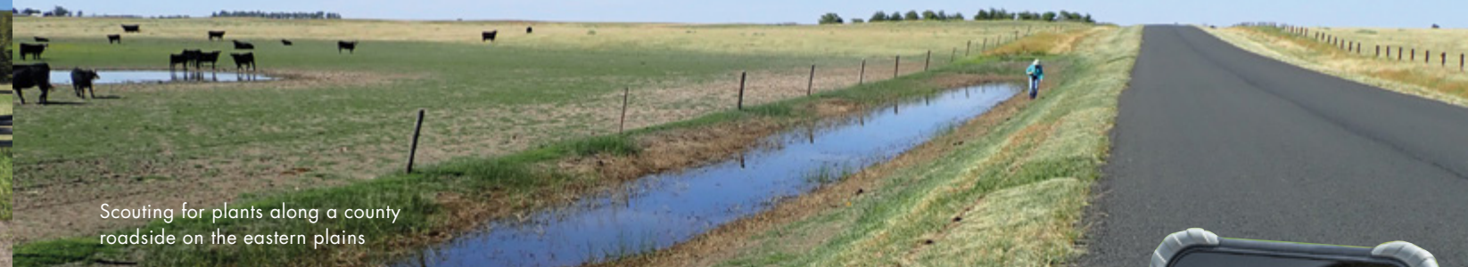
Scouting for plants along a county roadside on the eastern plains

An important goal of the herbarium is to build the collection from all areas of Colorado. The eastern plains comprise over a third of the state, but account for a small fraction of collections when compared to mountainous areas. Last summer, we made three trips, visiting four counties – Kit Carson, Cheyenne, Elbert and Washington – to collect plants along roadsides. The sandy areas of Elbert and Washington Counties were particularly fruitful. These trips yielded nearly 250 specimens, 30 county records and even one state record, Gossypium hirsutum (cotton). Thanks to efforts such as this, we now house approximately 69,100 specimens of vascular plants in the Kathryn Kalmbach Herbarium.