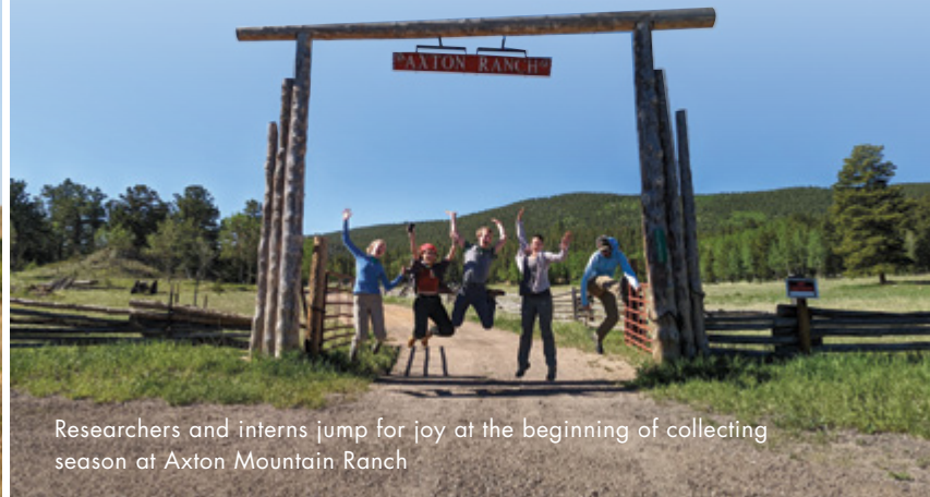
Researchers and interns jump for joy at the beginning of collecting season at Axton Mountain Ranch

This summer wrapped up our floristic inventory of a new Denver Mountain Park, Axton Mountain Ranch. Over the course of two summers, we collected approximately 415 unique species of vascular plants, representing about 13% of the flora of Colorado. Our inventory even included six different species of orchids! Through this project, we were able to provide six high school students with immersive, hands-on experience in the sciences. These students accompanied professional botanists on plant collection trips, learning how to make natural history collections and the importance of biodiversity research. This experience was so impactful that two of these students are now pursuing college degrees in the natural resources.