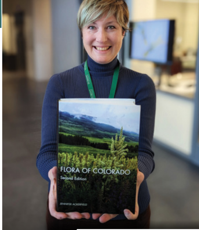
Author Dr. Jennifer Ackerfield

In fact, nearly 1,300 color photographs representing over 40% of the flora are included in the second edition. Photographs comparing difficult groups such as Cirsium (thistles), Mentzelia (blazingstars) and Astragalus (milkvetch) are especially useful – a description is helpful, but a picture is worth a thousand words. Black and white photos of seeds and fruit are also included for groups in which identification relies heavily on these microscopic characters, such as for the Amaranthaceae (amaranth), Boraginaceae (borage) and Nyctaginaceae (four-o'clock) families.