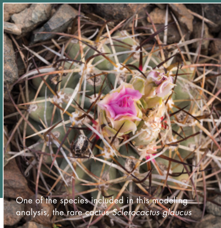
One of the species included in this modeling analysis, the rare cactus Sclerocactus glaucus