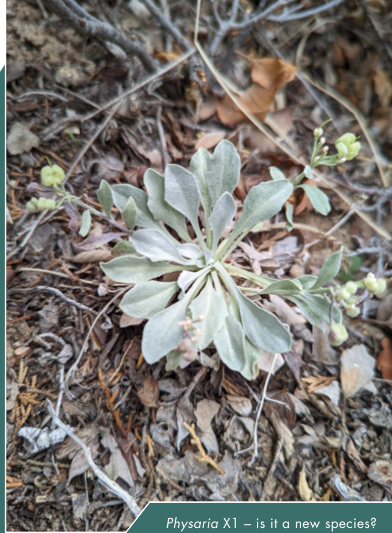
Physaria X1 – is it a new species?

A collaboration among several organizations, including the Colorado Natural Heritage Program, Denver Botanic Gardens, Jefferson County Open Space, Ken Caryl Open Space and the University of Northern Colorado hopes to answer an important question: Is this mystery mustard a new species? For many years, this mustard, known only as Physaria X1, has been unidentifiable and therefore misidentified, not truly fitting any currently described species. Last summer, we visited several locations to take leaf and soil samples of the mystery Physaria and closely related species, Physaria bellii and P. vitulifera . Using morphological, soil and genetic data, we aim to unravel the mystery of the misidentified mustard.