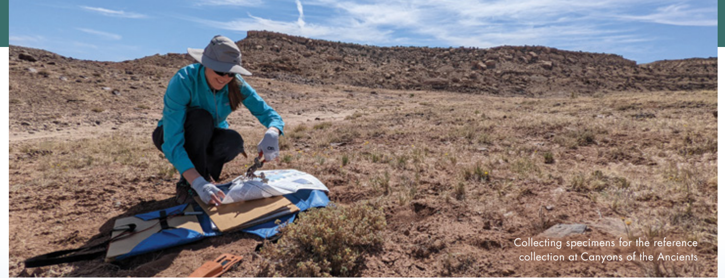
Collecting specimens for the reference collection at Canyons of the Ancients