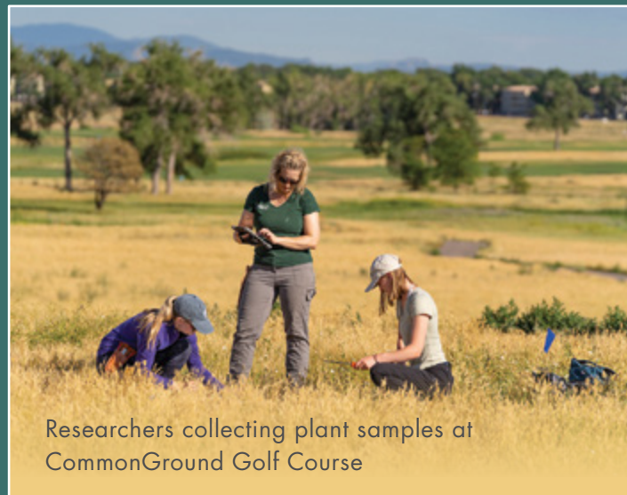
Researchers collecting plant samples at CommonGround Golf Course