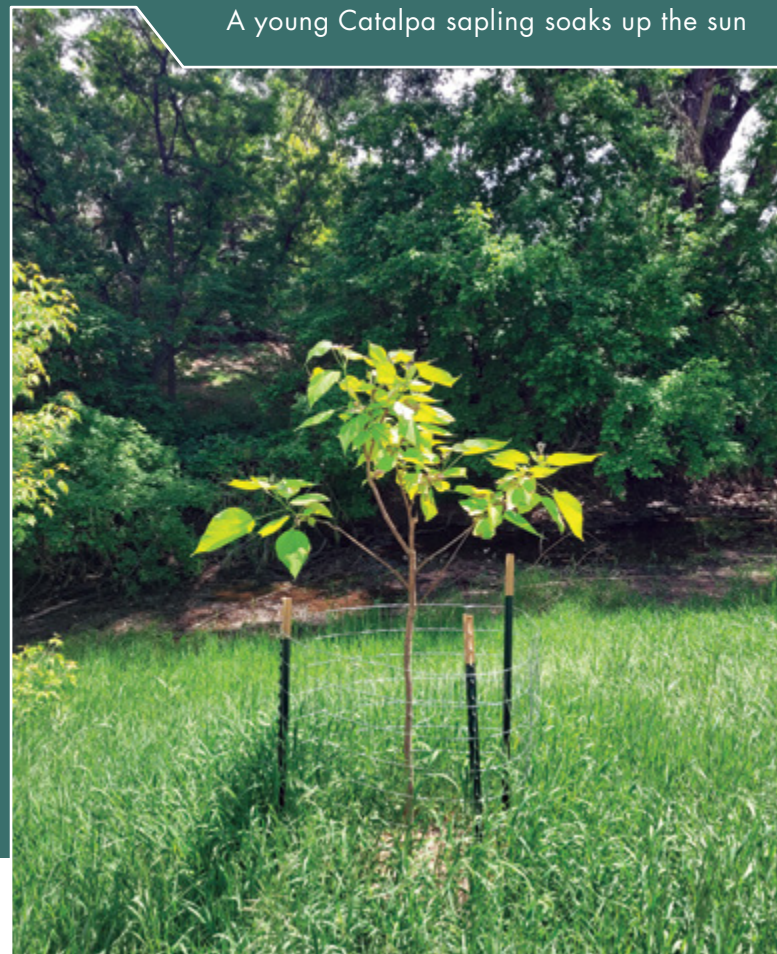
A young Catalpa sapling soaks up the sun

The High Line Canal greenway is a unique place in semi-arid Colorado where stately cottonwoods and willows thrive in an urban setting. Since the 1970s, the Canal corridor has evolved from its intended use in irrigation to a beloved 71-mile recreational corridor that beckons thousands of people to its shady banks each year. As the originally established trees age out, and as water scarcity issues become more pressing in the West, managers are planning (and planting!) for the future. We are supporting this effort by assessing how hundreds of newly planted trees, representing species with different stress tolerances, perform in relationship to their planting locations.