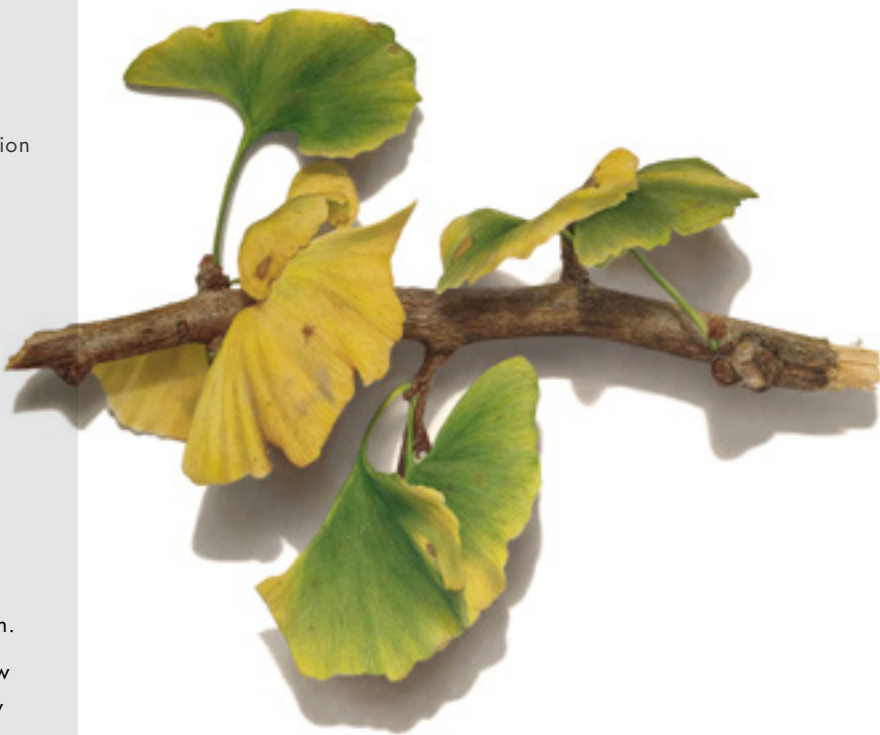
David Morrison, Ginkgo Twig Series No. 1 , colored pencil, 2023

Class 2: A low-pressure, small group learning critique to review your five botanical illustration plates (in whatever state they are in) and to answer your questions!