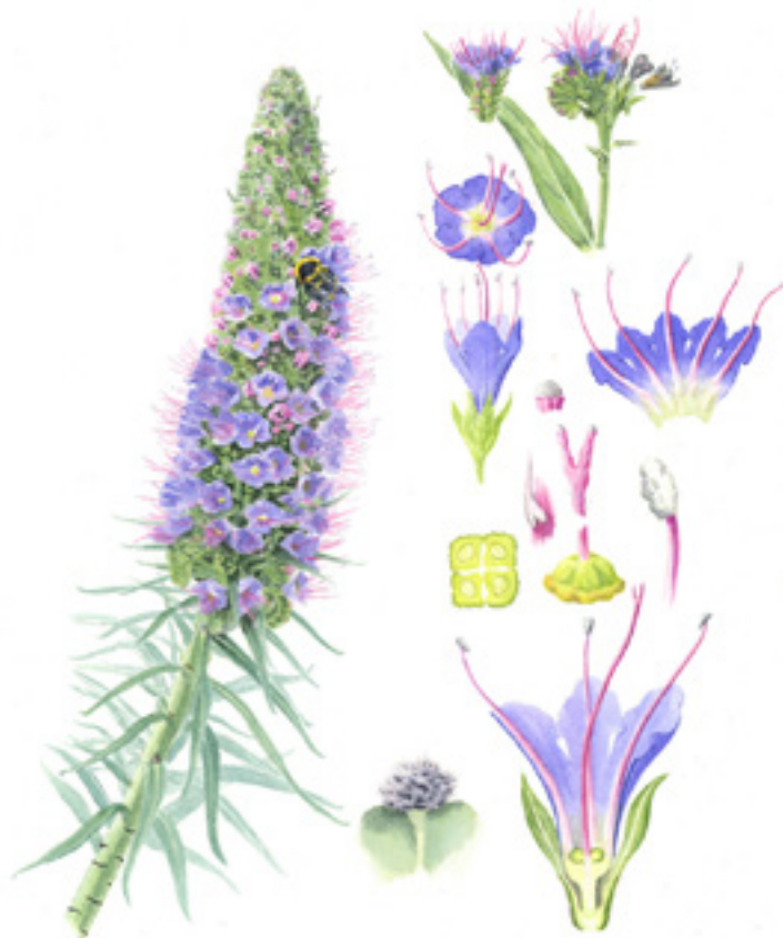
Charlotte Ricker, Pride of Madeira

Colored pencil presents a special challenge: mixing color directly on your drawing. Develop your own color workbook to speed color selection and application for future colored pencil drawings. Two-, three- and four-color mixing ensures the gorgeous greens, radiant reds and luscious lilacs you've been dreaming about. Class fee includes workbook by Susan Rubin; a curated set of colored pencils is available for sale.