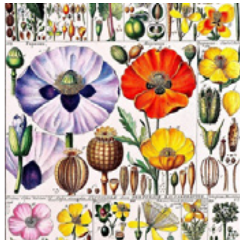
Christian Gottlieb, Classis XIII Polyandria , 1804

The incredible vascular plant diversity is wrangled into over 400 plant families. Yet, we tend to encounter the same handful of families repeatedly. Plants from these families are likely to be the subject of your art. Learn the morphological characteristics of these families to hone your observational skills and review the traits most critical to include in an illustration.